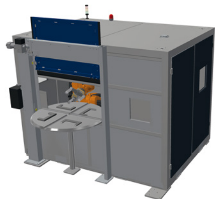
Loading via rotary table